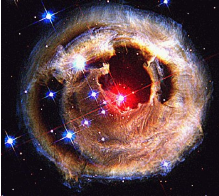
“Starry Night” - a star in the Milky Way, our galaxy