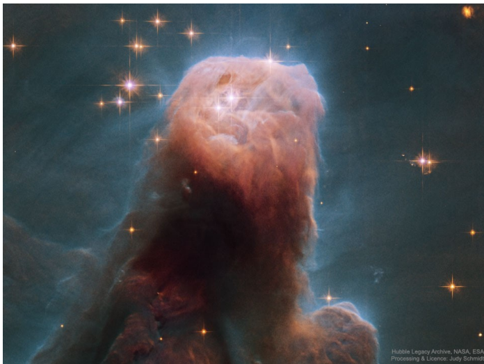
The Cone Nebula

Bless the LORD, O my soul, O LORD my God, you are very great. You are clothed with honor and majesty, wrapped in light as with a garment. You stretch out the heavens like a tent, you set the beams of your chambers on the waters, you make the clouds your chariot, you ride on the wings of the wind, you make the winds your messengers, fire and flame your ministers.