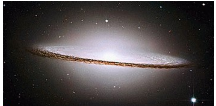
The Sombrero Galaxy, officially called M104 - 28 million light years from Earth, has 800 billion suns and is 50,000 light years across.

Telescope: “1. an optical instrument for making distant objects appear larger and brighter by use of a combination of lenses (refracting telescope) or lenses and curved mirrors (reflecting telescope)...2. any instrument, such as a radio telescope, for collecting, focusing, and detecting...” (Collins English Dictionary)