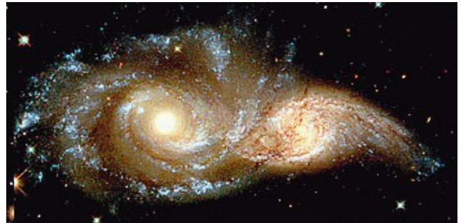
2163 in the distant Canis Major constellation